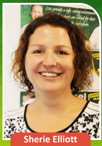
Mathematics Curriculum Leader